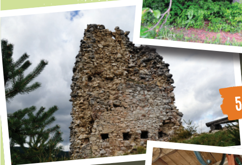
5. SNAKE CASTLE