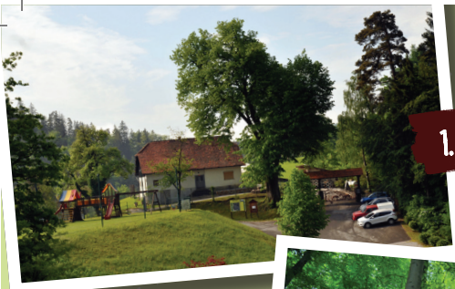
1. THE LAMPERČEK HOMESTEAD