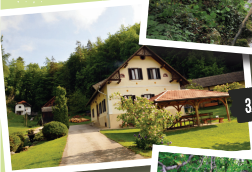
3. VOVK MILL